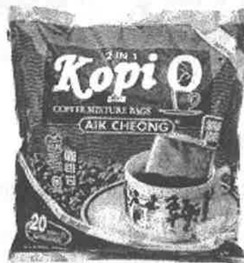
Aik Cheong Kopi O Coffee (20s)