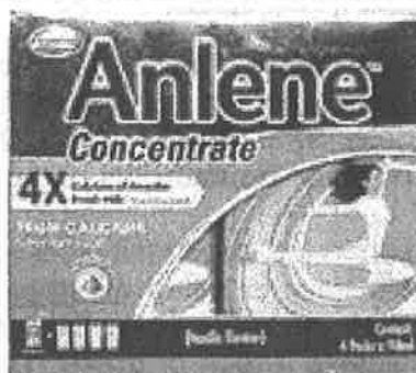
Anlene Pkt Milk (4 pkt x 100ml)