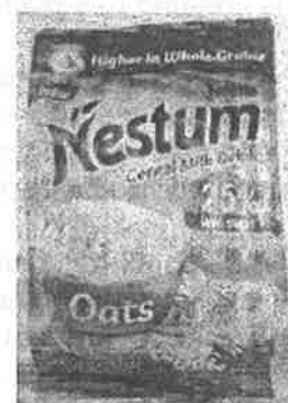
Nestum Cereal Milk Drink (18s)