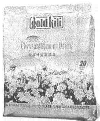
Goldkili Chrysanthemum Tea (20s)

These are the items that you can contribute: