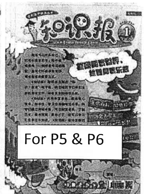
For P5 & P6