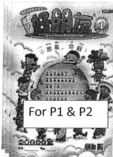
For P1 & P2